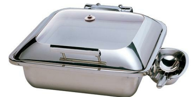
(shown with optional spoon holder)